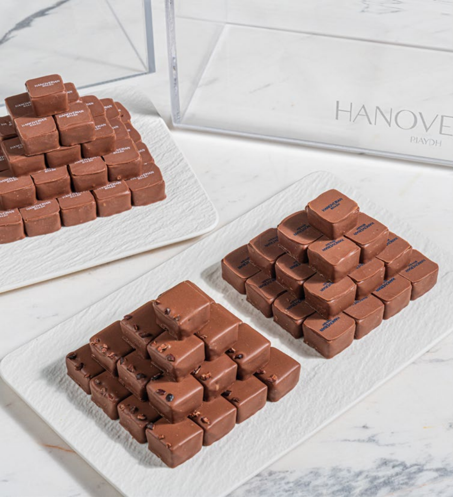
Hanoverian Mix Brand